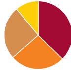
Allocation of underlying funds†