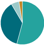
Allocation of underlying funds