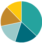
Allocation of underlying funds*