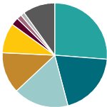
Distribution by sector