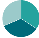
Distribution by issuer—bonds